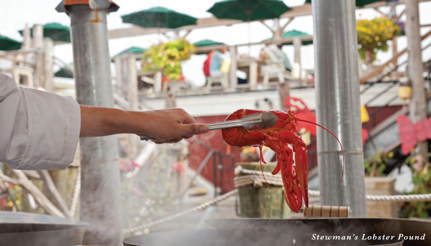
Stewman's Lobster Pound