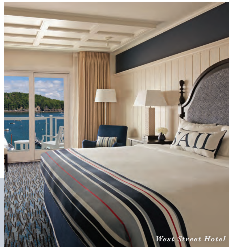
West Street Hotel