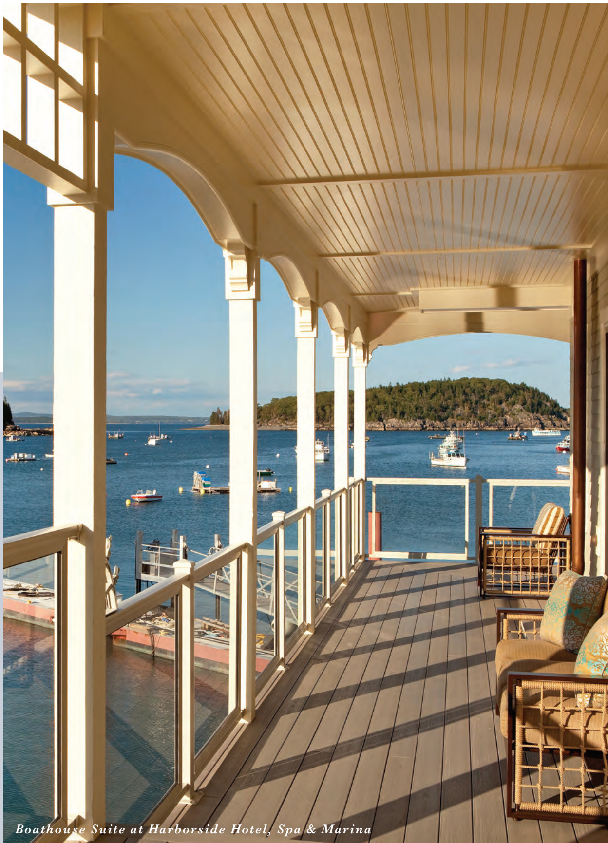
Boathouse Suite at Harborside Hotel, Spa &amp; Marina