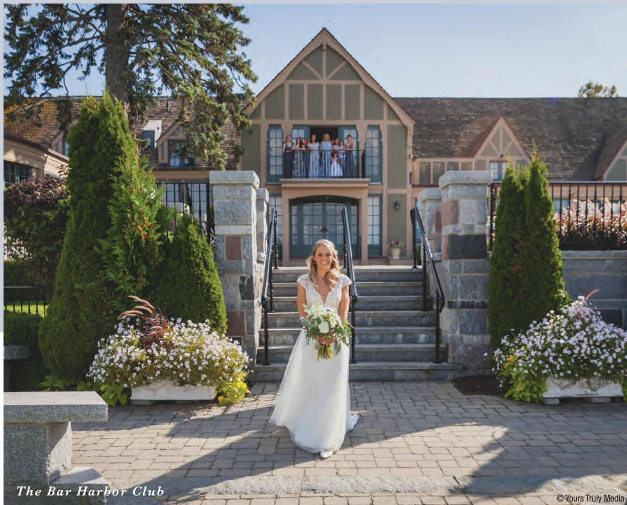
The Bar Harbor Club